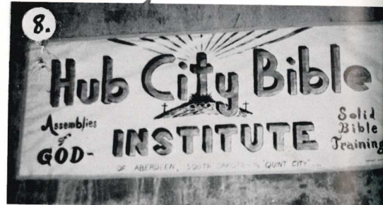
4. Head table - Thanksgiving Banquet. 5. Last sack. 6. Signing in at the Bachelor Club. 7. Milk break for the "Quints." 8. Sign by MDVW-DEF INC. (used for a parade)