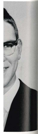
agner N. Dak.