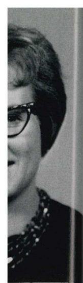
ooks S. Dak.