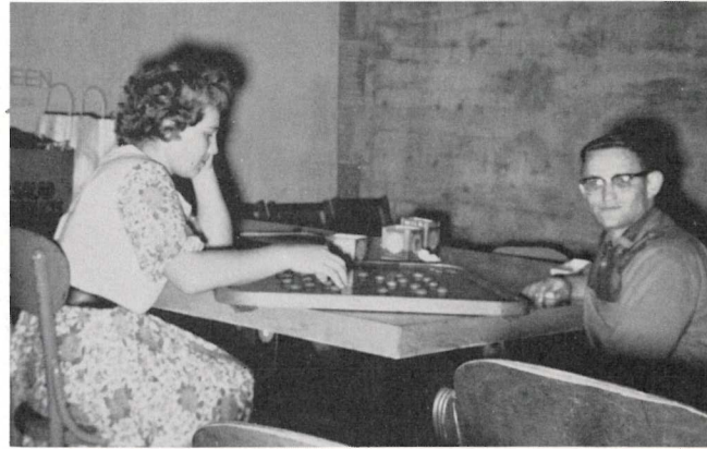
"Never was to let a Freshman girl beat me."