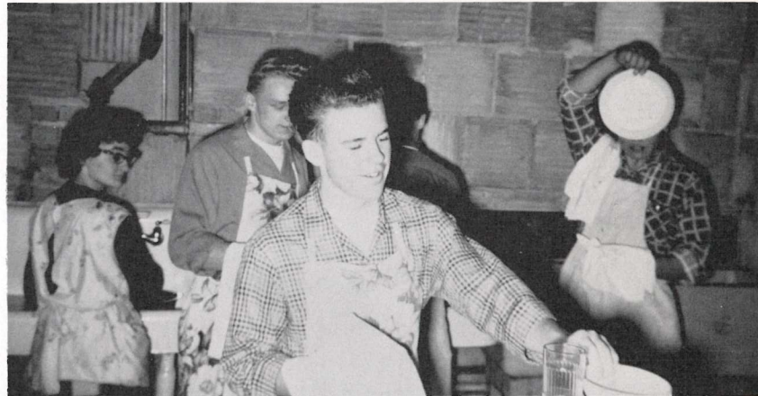
"Oh, happy, happy dish crew!"