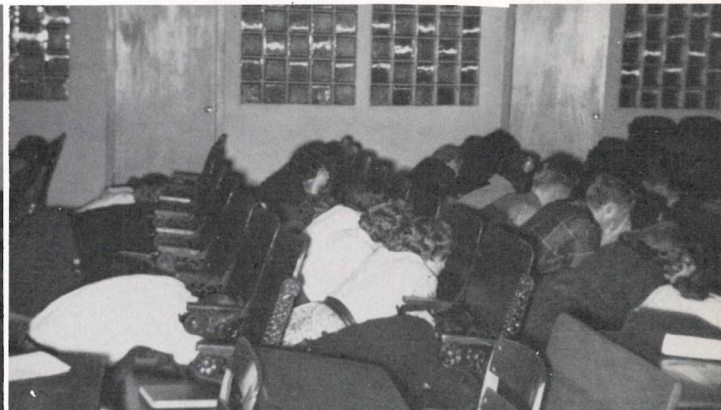
"They that wait upon the Lord shall renew their strength."