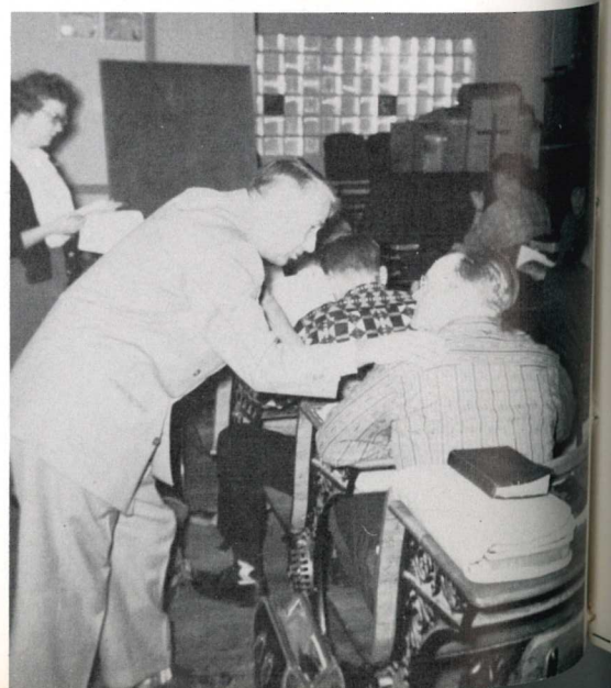
"Now, how many times must I tell you that you can't do that?"