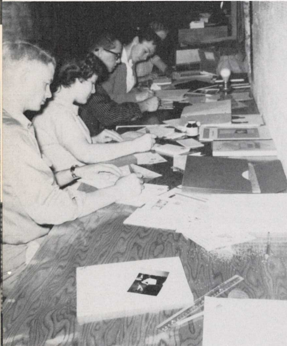
The annual staff strikes a familiar lay-out pose.