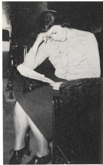
This cramming is going to be the death of me!