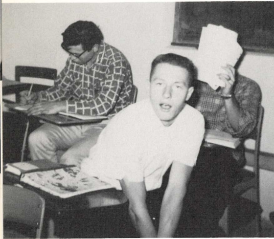
I'm not as dumb as I look, I just cracked under the strain!