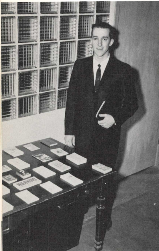
The tract man.