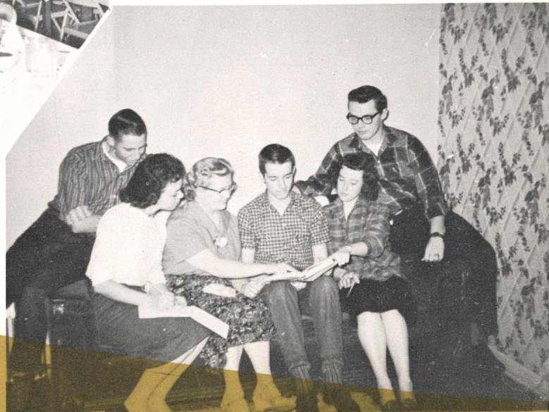
This portrays the Social Committee busily preparing for the Thanksgiving dinner. There is very little glory that goes with the job of the social committee. It is one of those "behind the scene" jobs. The only rewards for their hard work are the smiles of approval as the students participate in the different activities.