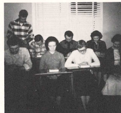
"Prayer before class"