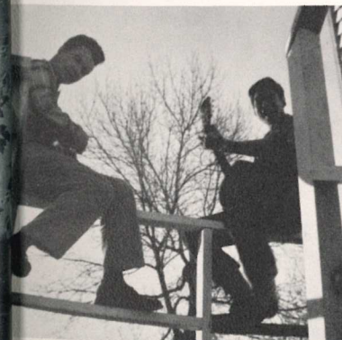
"Strumming and singing"