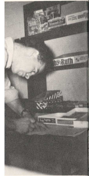
op, and ice cream"