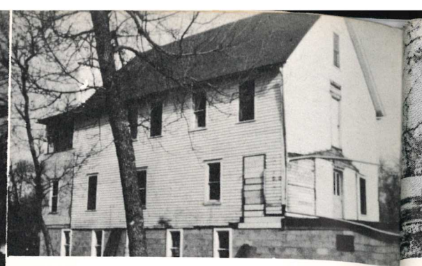
Ten Years Ago