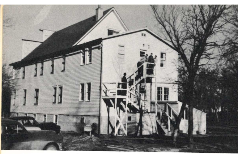
The Bible School Building today