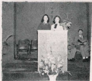
Outstation Participation Flat Fire