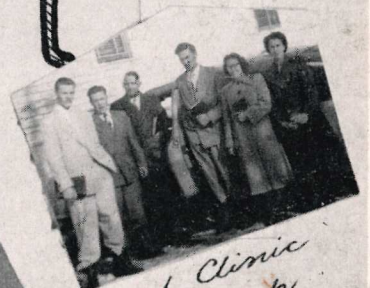
Soul Clinic Group