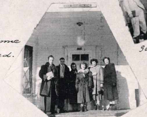
Rest Home for the Aged.