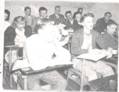
Class in Session