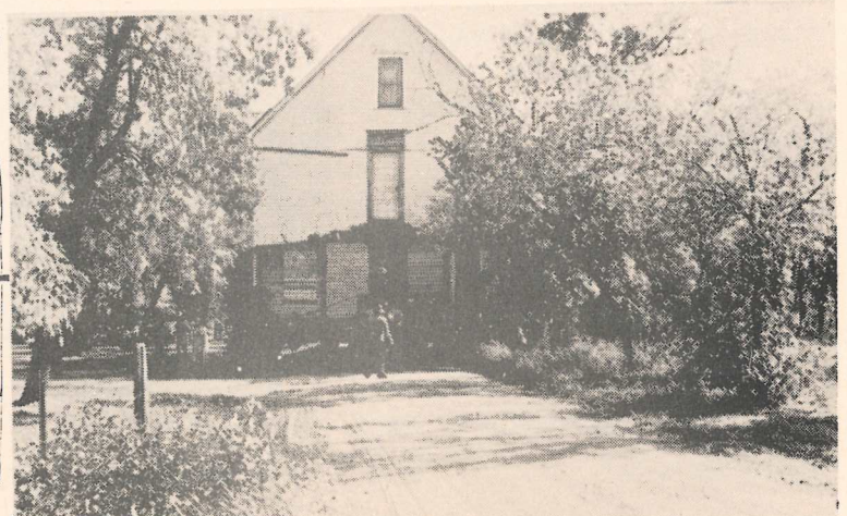
THE LAST LAP OF THE JOURNEY

Two buildings were in the plans for this project, the hotel building pictured here, and a two and a half story building at Leeds, N.D., which the District owned, and had previously used for a chapel in that town. The building pictured here on this page is the girl's dormitory, the kitchen, cafeteria, offices, and one apartment. Some remodeling and repair was necessary, and more will become necessary as time goes on.